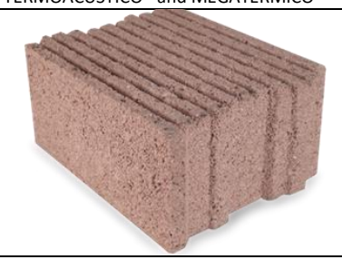
Illustration of the product:

Thermal masonry units which doesn't requires the use of ETICS TERMOACÚSTICO® and MEGATÉRMICO®