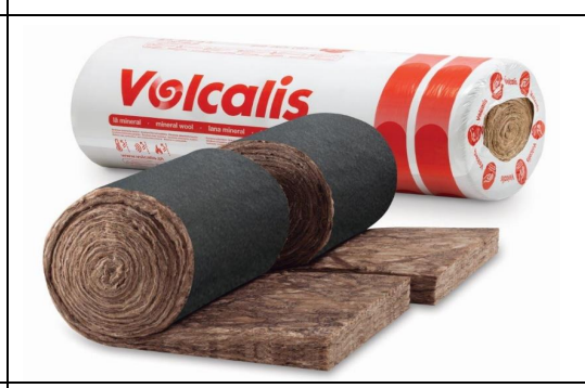
Illustration of the product:

Mineral wool (MW), coated with black veil, density 18,5 kg/m³(Volcalis Alpha), thickness 50 mm