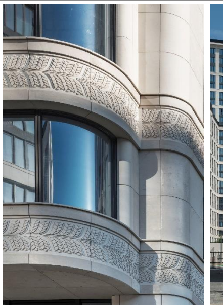
Illustration of the product:

Slabs for exterior and interior claddings and flooring, in natural limestone, including the following references: beige pacífico, pérola, sonato and topázio; amazona topázio; semi-rijo branco real, imperial, snow and of mar; estremadura creme, azul and amazona; moca-creme fino, médio and grosso; azul primavera and atlântico; creme champanhe, vale amazona and lioz; beige clássico, azul clássico, amazona clássico and branco clássico.