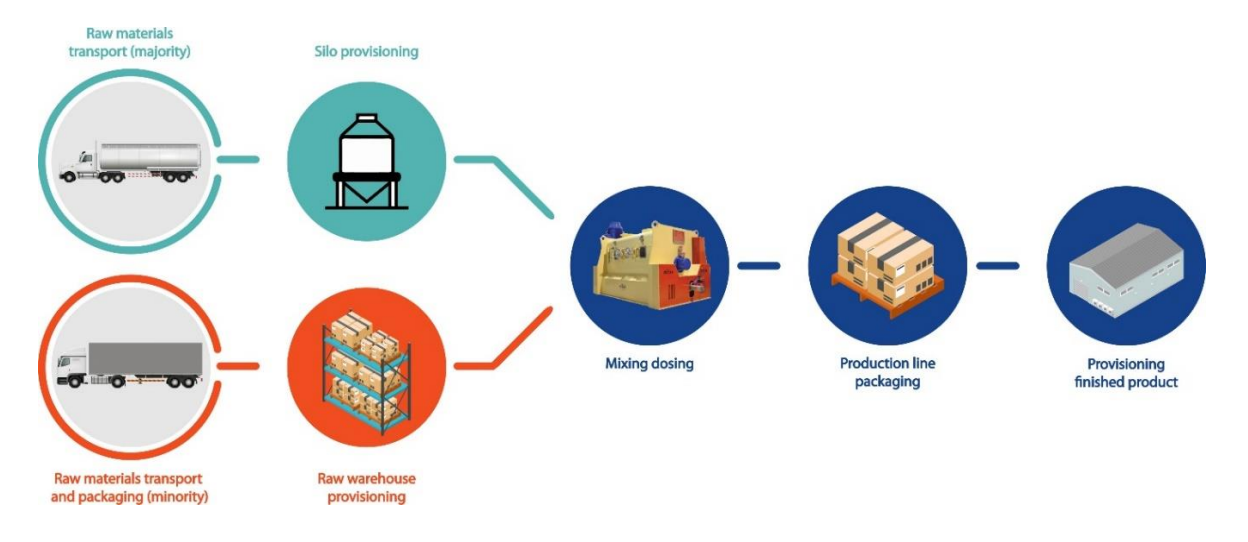
Figure 2: Production schema

Raw materials are transported in tankers, in plastic bags or big-bags. The bulk materials are stored in silos. The final powder product is obtained from the mixture of different components, based on a pre-established formulation. The dosing of raw materials can be carried out by a worm screw with frequency controller and volumetric dosing by means of a rotary valve. Weighing of the different components takes place within one of the three weighing hoppers. The dosed components are then discharged into the mixer via pneumatic valves for homogenization. The mixing time varies according to the specific composition of the product. After this, the product falls into the mixer hopper and is then discharged.